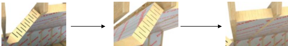
Figure 1: Installation of Xtratherm Rafterloc between rafters

A second layer of NSAI Agrément approved Xtratherm XT/PR insulation can be fitted beneath the rafters. The XT/PR board should be butted tightly against adjoining panels and temporarily fixed to the underside of the rafter with large headed clout nails. A suitable vapour control layer should be provided between the XT/PR board and the internal finish.